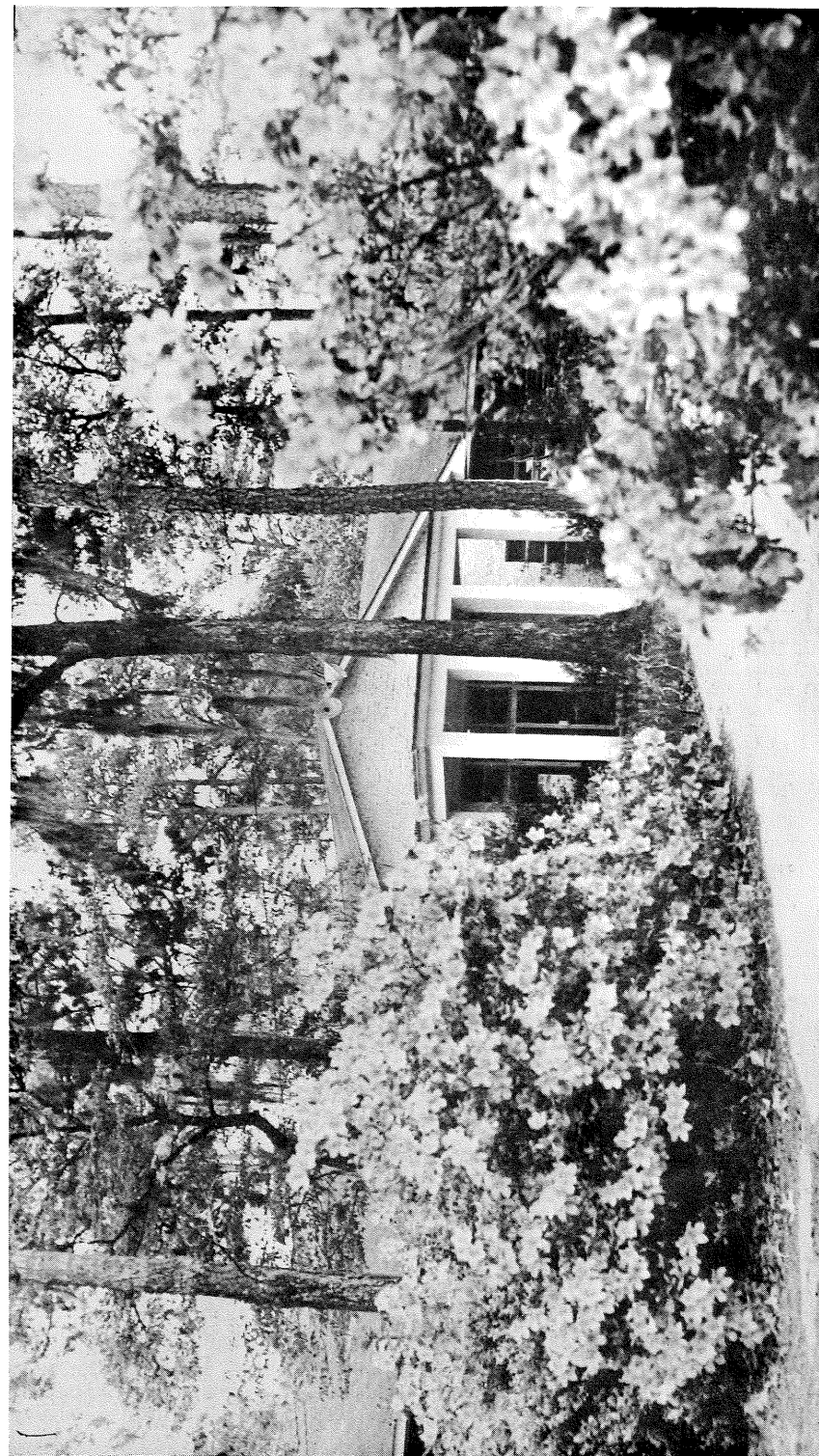
SOCIAL SCIENCE BUILDING

The first two years of work for students who plan to enter schools of medicine or dentistry. Pre-medical students planning to enter schools requiring a foreign language must schedule French or German during the third and fourth years.