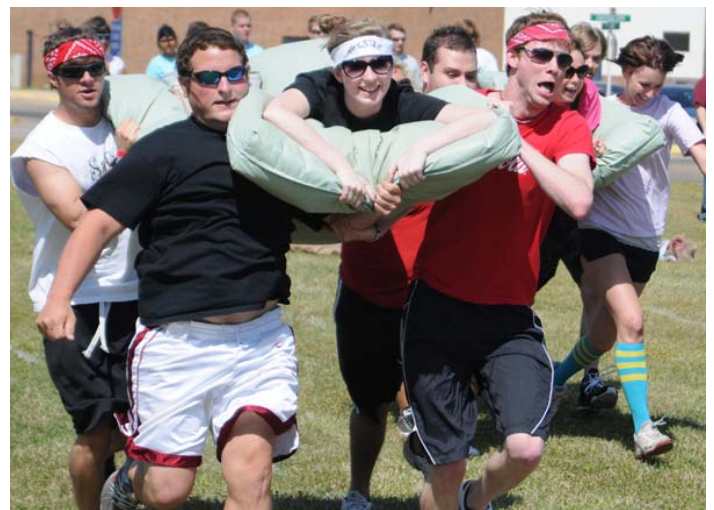
The Chipola Theatre Player’s Club team races to victory in the relay competition at Spring Frolics on Wednesday.

For information about Chipola Theater, call 718-2227.