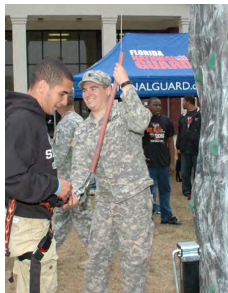
More than 1,000 area students attended the annual Chipola Regional Career Fair on Nov. 14. Here, an Altha High School student suits up to climb the National Guard rock wall.