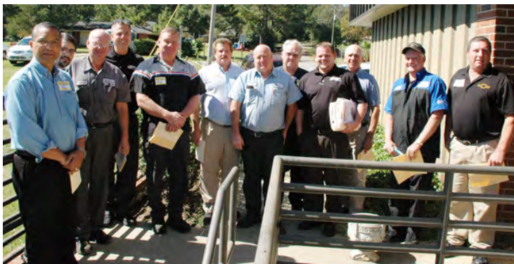
Members of the Automotive Advisory Committee