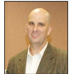
For information about the program, contact Chipola Student Activities Director at 718-2314.