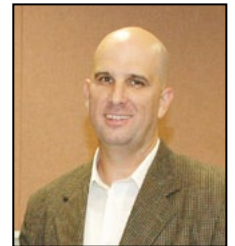
For information about the program, contact Chipola Student Activities Director at 718-2314.