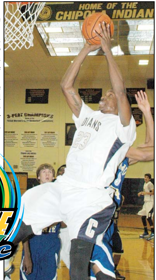
Chipola Men play at 6 p.m. Dec. 6 & 7. For more about the Indians' 2013-14 season, visit:

www.chipola.edu/extrac/athl/2013-14Season.pdf