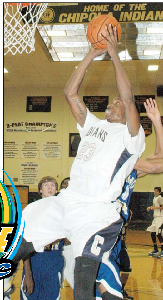
Chipola Men play at 6 p.m. Dec. 6 & 7. For more about the Indians' 2013-14 season, visit:

www.chipola.edu/extrac/athl/2013-14Season.pdf