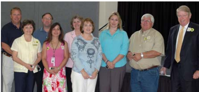
10 Years of Service