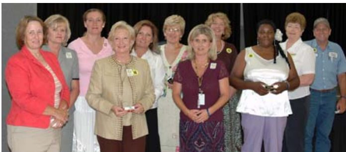
20 Years of Service