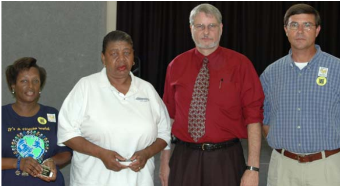
5 Years of Service