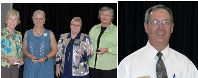
25 Years of Service