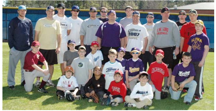
Chipola baseball alumni turned out in full force for the second annual reunion. Several former players shared their skills in a camp for future major leaguers.

For information about Chipola baseball, visit www.chipola.edu