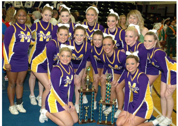
Hundreds of fans turned out to cheer for the cheerleaders at the Cheerleader Extravaganza on February 8.

Marianna High Varsity was named Extravaganza Grand Champion for receiving the most points in the overall competition. Exhibition squads included: JAGS All Stars: Youth Team and Mini Team and Junior MEGA All Stars.