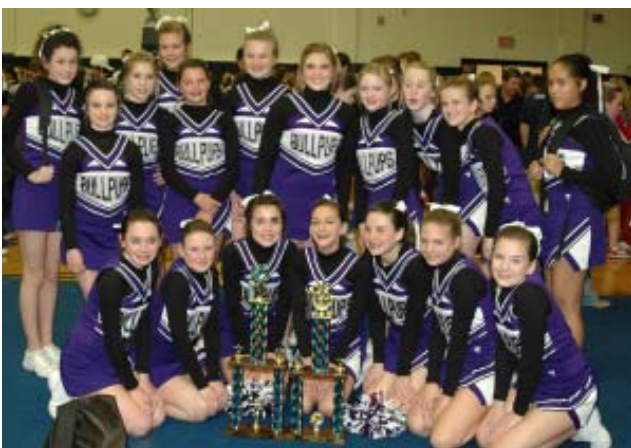
Here, the Marianna Middle School squad poses with their First Place Large Middle School and Middle School Spirit trophies.

GATOR SCHOLARSHIP. The Northwest Florida Gator Club is offering scholarships to entering juniors at the University of Florida's West Florida Research Education Center in Milton, FL. Applicants must have applied, been accepted, and plan to attend the University of Florida at WFREC during the 2009-2010 academic year.