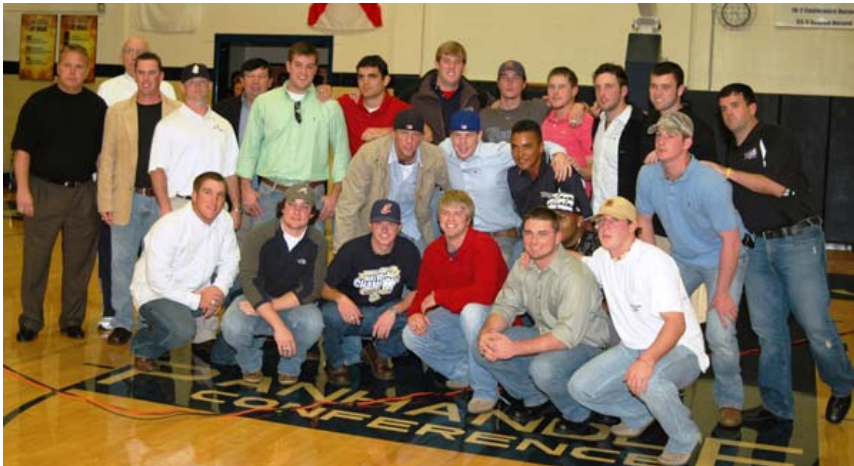
2007 National Championship Baseball Team

Chipola's 2007 National Champion Baseball and Softball teams were honored at Championship Ring Ceremonies during the CC vs. OW games on Jan. 12.