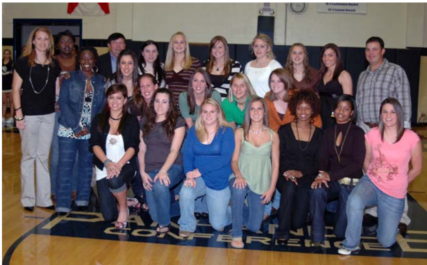
2007 National Championship Softball Team