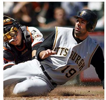
Jose Bautista Pittsburgh Pirates