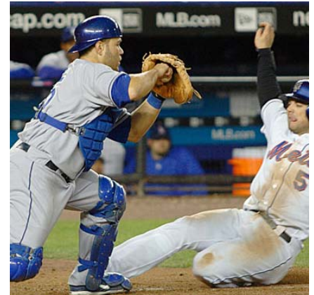
Russell Martin Los Angeles Dodgers

For information, call Chipola Baseball at (850) 718-2332.