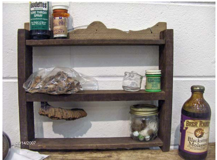
“Family Medicine” is one of the pieces now on display at Chipola.