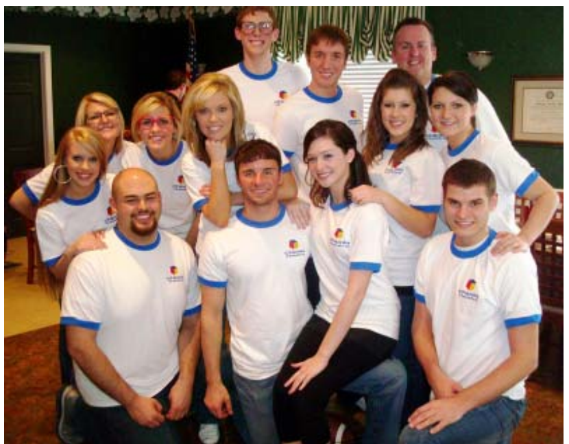
Chipola College theater students (pictured) presented the program at the April meeting of the Chipola Regional Arts Association.