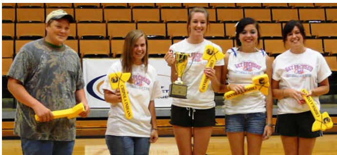
Cottondale High School’s “Team Awesome”