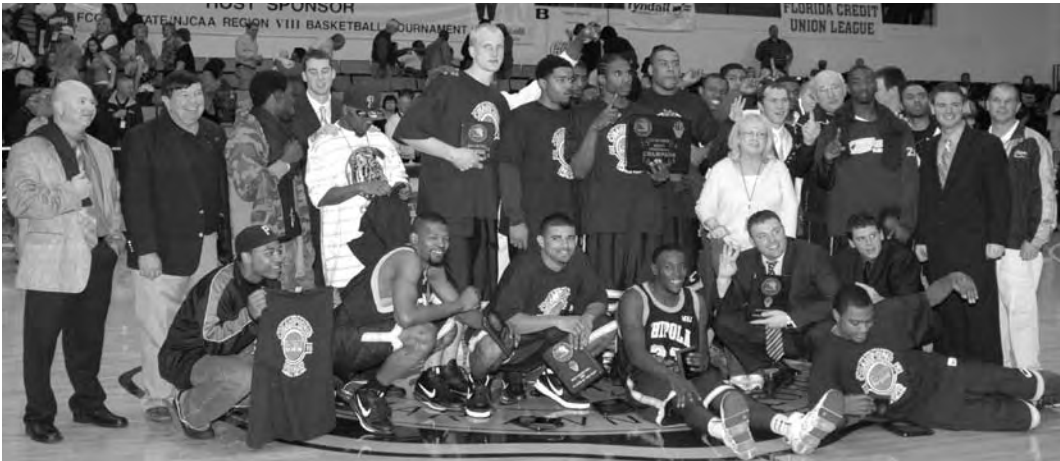
Chipola celebrates their third state basketball title in the last three years in March 2009.

The Chipola College men's basketball team captured their fourth state title in five years with a 68-65 win over Gulf Coast in the FCCAA/Region VIII Championships on March 7, 2009.