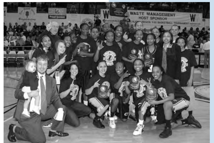
The Lady Indians celebrate their victory over Gulf Coast to take the title.