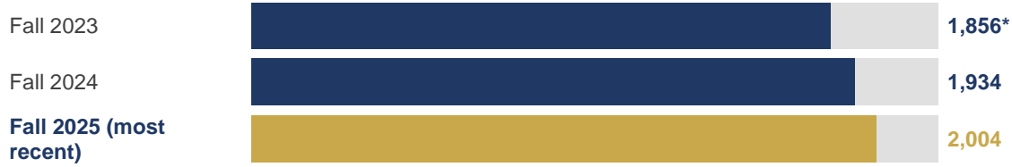
Figure: Horizontal bar chart of total fall enrollment 2023–2025. Fall 2023: 1,856 (estimated). Fall 2024: 1,934. Fall 2025: 2,004 (most recent, shown in gold).. Data values are listed in the table above.