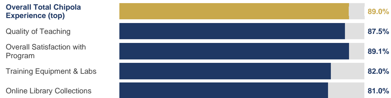
Figure: Percentage "Satisfied or Very Satisfied" with educational experience components, 2025–26 GSS (n=310–456).. (top) denotes highest-rated item.

Questions 25–29 measured satisfaction with components of the overall educational experience.