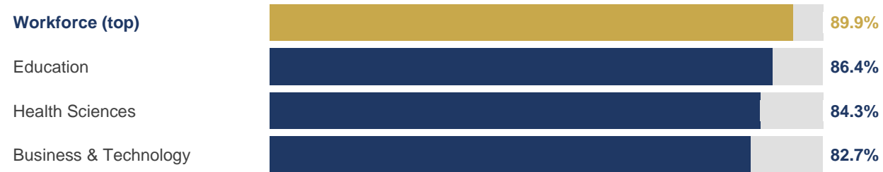
Figure: Percentage of graduates rating departmental coursework as "Satisfied or Very Satisfied," 2025–26 GSS. Workforce rated highest at 89.9%.. (top) denotes highest-rated item.

Questions 16–19 asked graduates to rate satisfaction with coursework in each academic department, using a five-point scale with a "Cannot Evaluate" option for departments where no courses were taken.