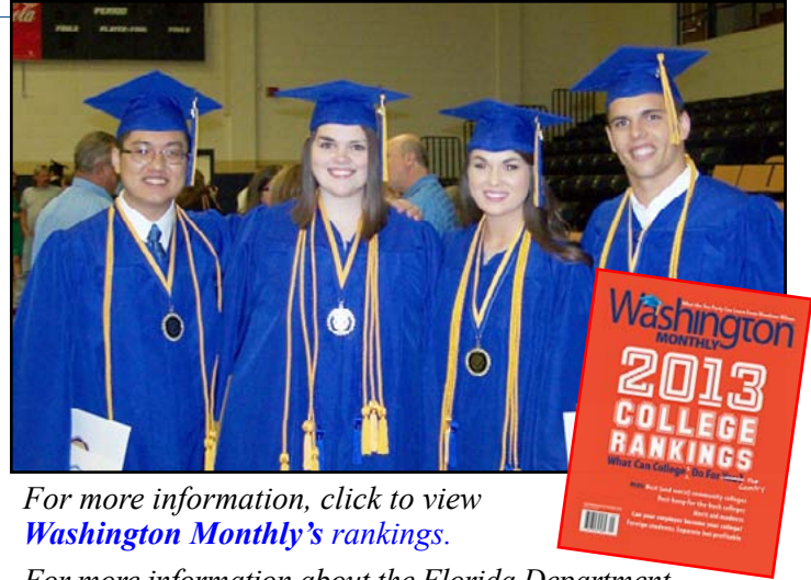
For more information, click to view Washington Monthly’s rankings .

Chipola had a first-year retention rate of 65.9 which was fifth among the top 50 colleges. Chipola was eleventh in the Three-year graduation/transfer rate at 57.9 percent. This number indicates the percentage of students who graduate or transfer to another college within three years of first enrolling.